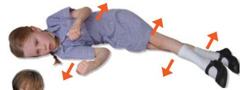
Going stiff, dropping to the ground and jerking

There are many different types of seizures. Some of the more common seizures may look like: