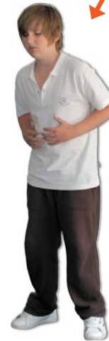
Feeling sick, 'edgy' or strange